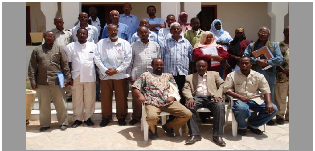
Koox hawleedka barnaamijka maamul baahinta

oo awood u siinayey degmooyinka ku dhaqanka maamulka awood qeybsiga xukunka oo ku dhisnaan doona dakhli abuuris , kharaj bixin iyo la xisaabtan dhab ah. Hase ahaatee hanaanka siyaasadeed ee geedi socodka Baahinta Maamulka waxa saameyn ku yeesho heerka bulshada aqoonteedu gaarsan tahay, wacyiga iyo biseylkooda siyaasadeed