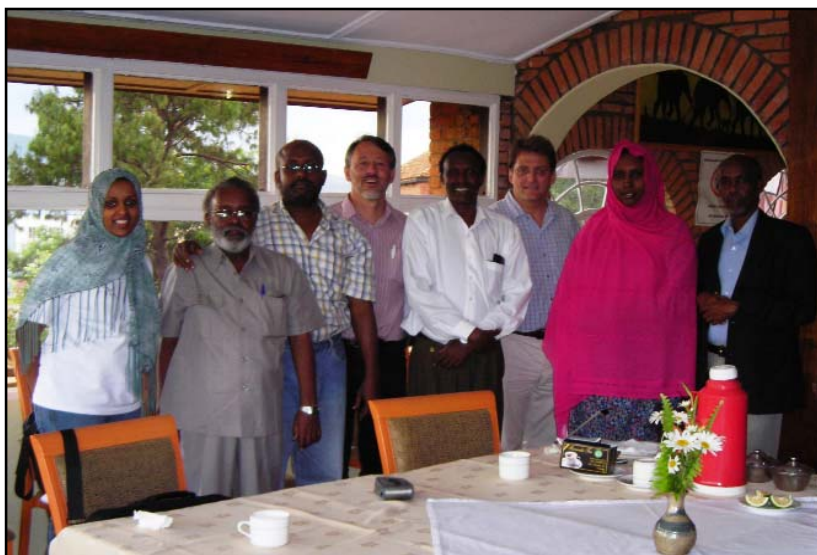
Interpeace and Somali partners-PDRC, APD, and CRD-in the first Peace-Mapping workshop.

The International Peacebuilding Alliance (Interpeace) and its Somali partners-PDRC in Puntland, APD in Somaliland, and CRD in South Central Somalia-are taking peacebuilding in the Somali region in a new and promising direction. The outcome of the Peace-Mapping project, or Astaynta Nabadda, will have huge implications not only for the Somali stakeholders and international community but also it provides peacebuilding alternatives for countries that are well on the way to securing peace.