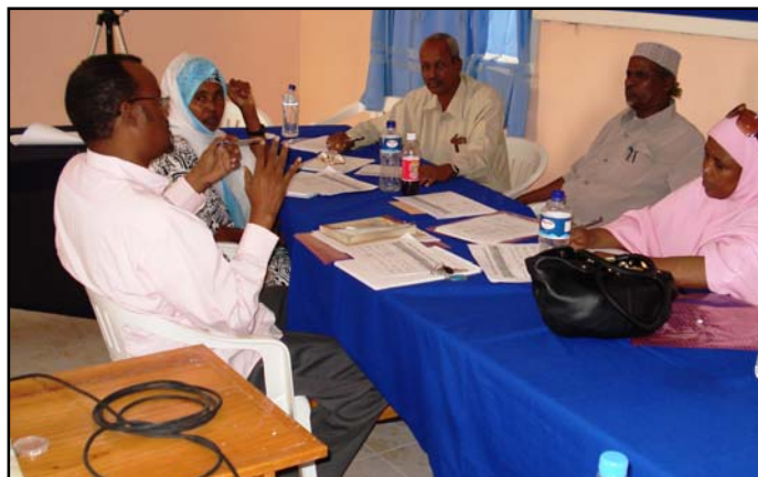
Working Group members generating a list of significant peace and reconciliation initiatives in Puntland