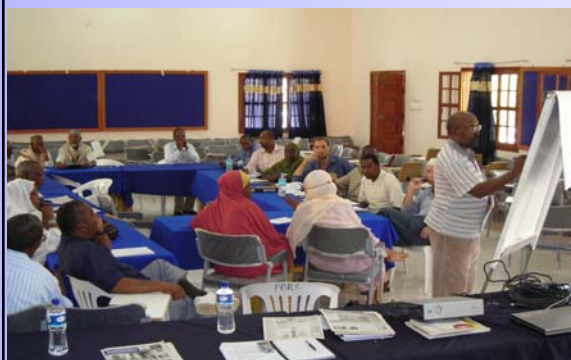
working session of the Security Workshop

During the past three months of security volatility the Nugaal Coordination and Development Committee, a 21 member committee endorsed by Nugaal Paramount Elders, was engaged in coordinating and streamlining the