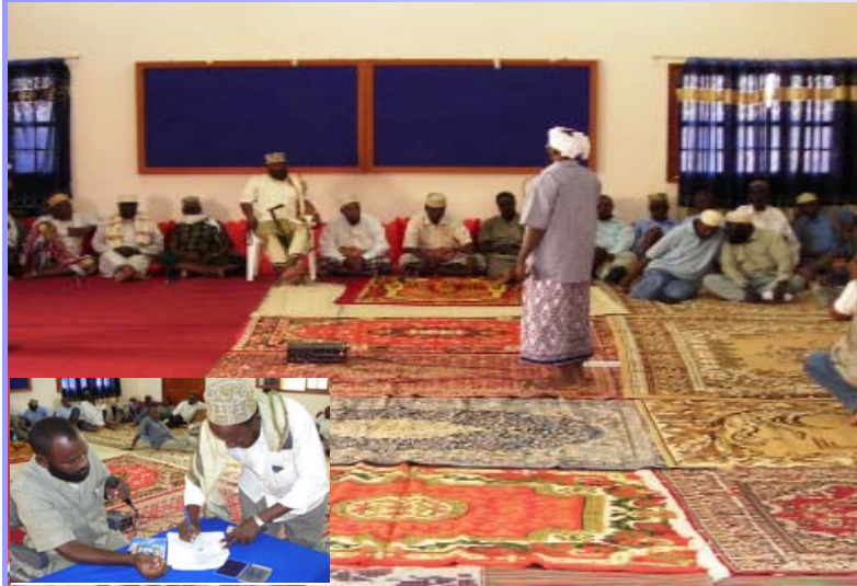
Xarunta PDRC oo ay ku shirayaan Guddiga isku Xirka iyo Horumarinta Nugaal

Nugaal community Coordinating and Development Committee signing agreement at PDRC main Conference Hall