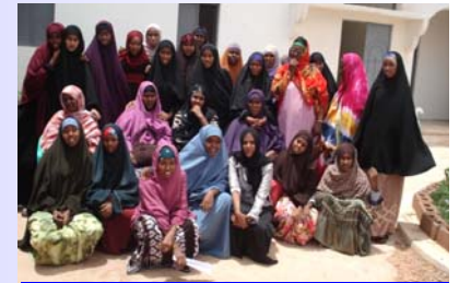
Gender training at GECPD Center