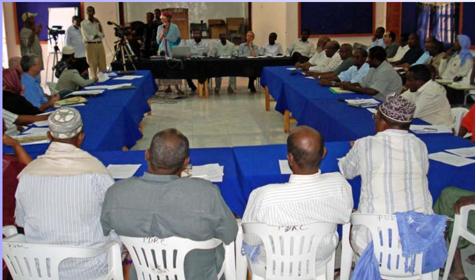
The Joint Security effort Workshop hosted by PDRC

At the same time, when problems arise, the first to