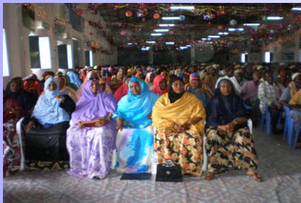
Qolka shirweynaha oo doodihii ka socdaan